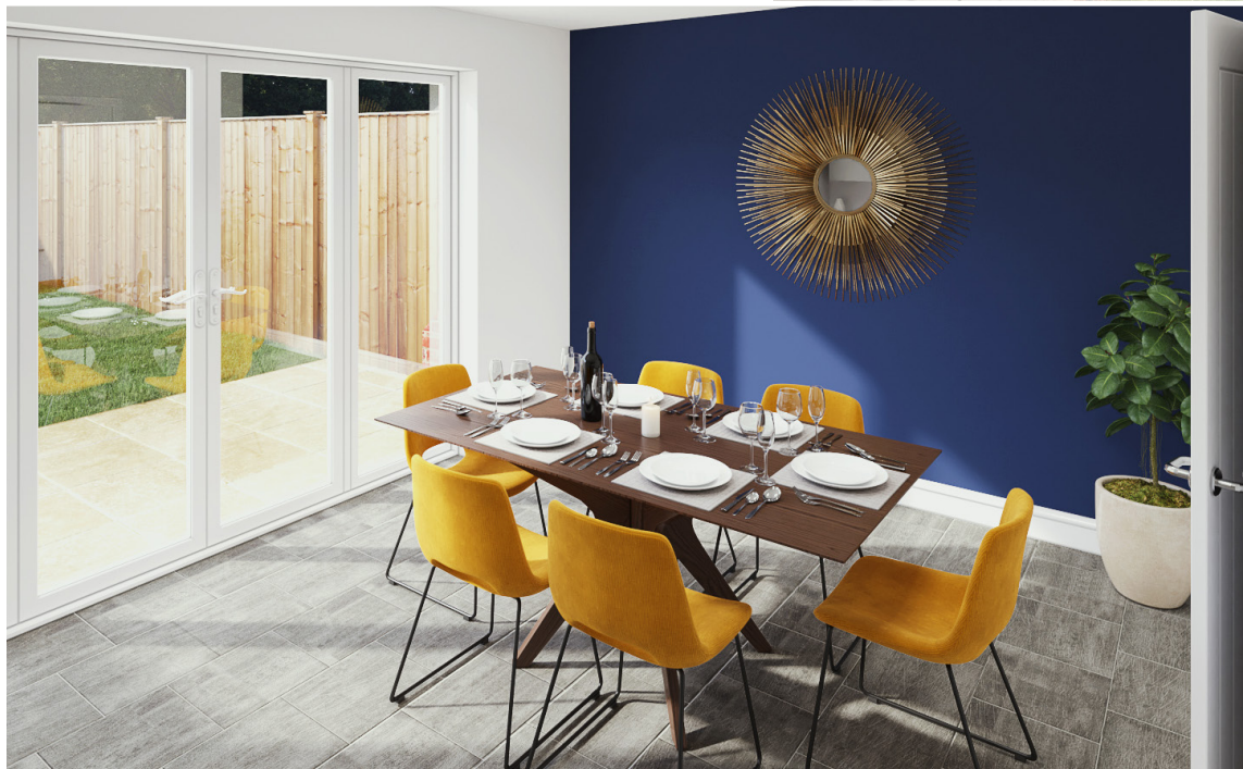
Top right: Low carbon, energy efficient homes at Springfield Meadows, Southmoor, Oxfordshire