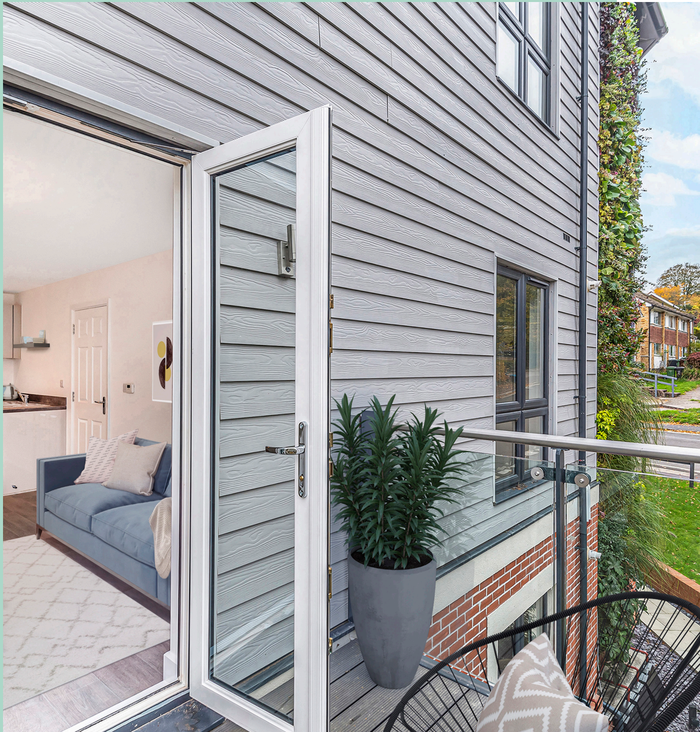
Above: Our new development complements existing homes at Wilkins Court, Henley-on-Thames, Oxfordshire