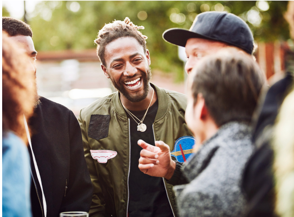
Left: Talking to our customers and adding social value are essential

In some cases, conversations on specific projects are already underway. As with any complex property transaction we have to follow a prescribed planning process – that means we can't say everything to everyone all at once. We know that lots of people will have questions about the impact that the Strategic Asset Management plan has on them, in our business, in the community and amongst our stakeholders. But above all we know that our customers will want to know how this will affect them and their homes. We expect that the vast majority of the properties we sell will be sold as they are vacated – very few customers will have to move home. But communication of specific plans will need to be sensitive and timely.