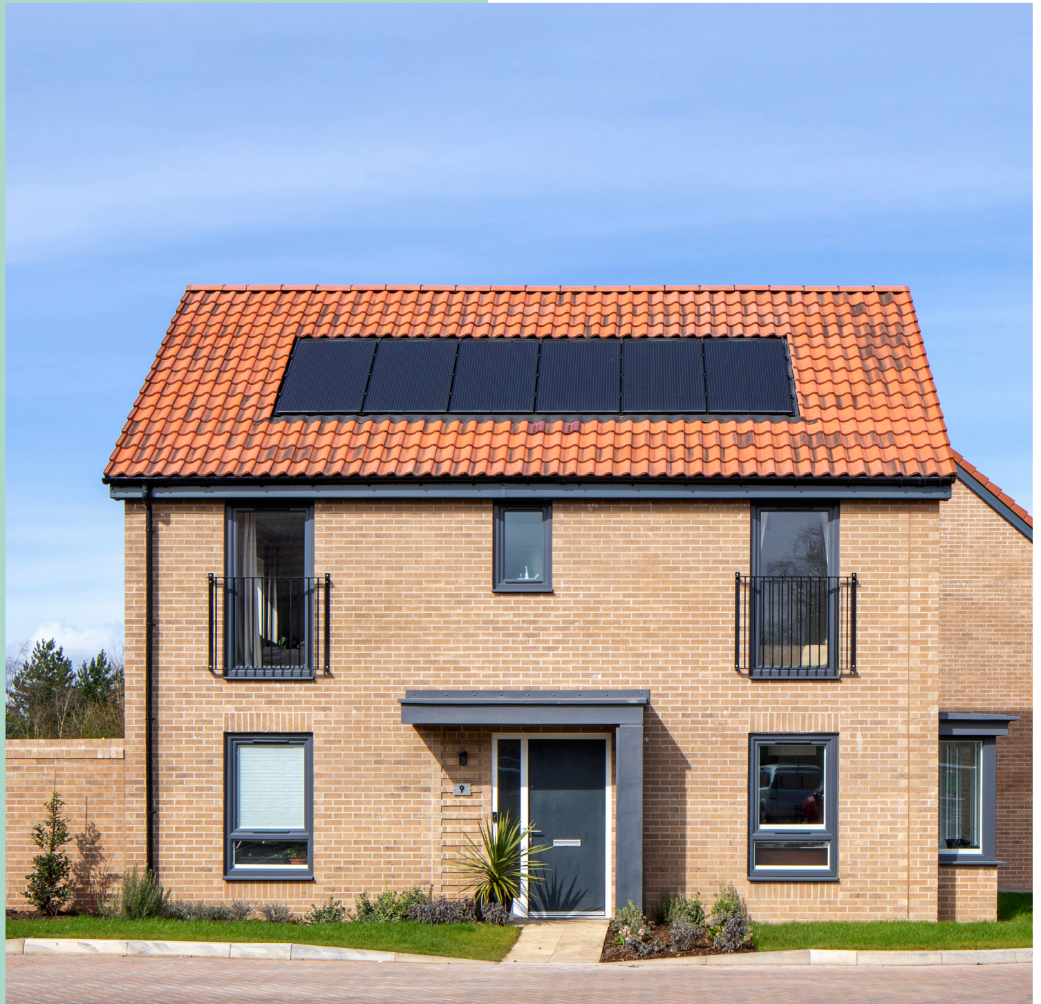
Above: Sustainable energy sources supply homes at Blackberry Hill, Bristol

Sovereign Housing Association Limited is charitable CORP-31367 Apr21inh V1