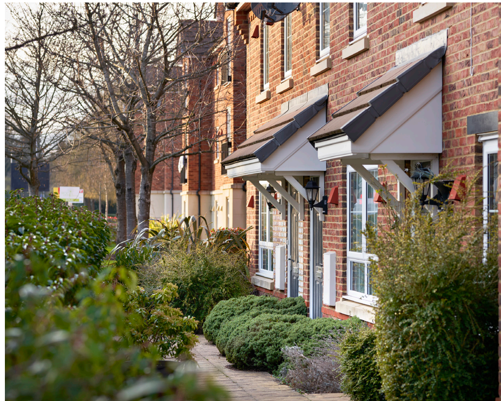
Left: And after redevelopment, a green, tranquil, people-centred environment

Strategic Asset Management plans on this scale don't have clear start and finish dates. This plan is a signpost, not a finishing post. But by 2050 we will have significantly more homes and customers than we do now.